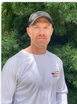
Gregg Hobson Storey House