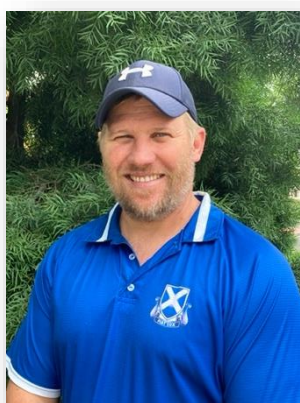
Lieben Pietersen Twells House